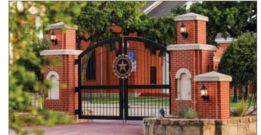
HPU was recently honored by Forbes for financial strength.

Forbes utilizes data from the Department of Education's National Center for Educational Statistics. The list includes only schools with more than 500 full-time students, and public institutions were not graded. The publication's methodology uses nine measures: endowment assets per